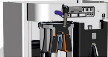
1 Hot - 1 Cold Station With Airbag (no Flanging)